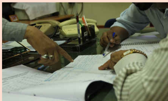
A platform to build capacity of municipal functionaries to achieve objectives of the Swachh Bharat Mission

The Swachh Bharat Mission (Urban) is a major initiative of the Ministry of Urban Development (MoUD), Government of India. While addressing the need for the capacity building, MoUD has introduced the e-course on capacity building of municipal functionaries. It introduces challenges and solutions in the field of urban sanitation to municipal functionaries who are at the forefront of delivering objectives of the Mission.