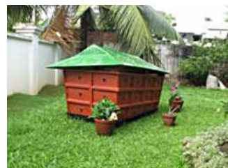
Bio Digester Bin for Apartments

CREDAI Clean City Movement has been appointed as the participating agency in integrated Solid Waste Management programme organized by Corporation of Kochi, KSUDP and District Administration. Certificates are issued to all builders who have implemented bio-bin system for self contained solid waste management. The certificate of CREDAI Clean City Movement is accepted by Corporation as proof of implementing self contained Solid Waste Management system in building complexes while applying for completion certificate.