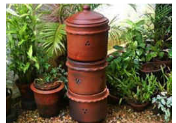
Bio Digester Pots for Individual Homes