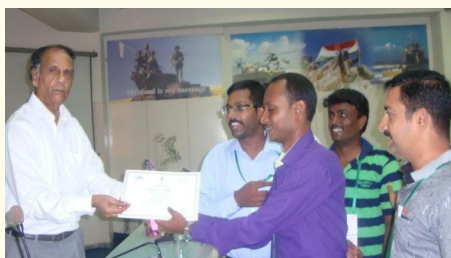
Figure 2 Participants receiving prize from Prof. Masilamani, Batch 10 (September 22nd, 2016)