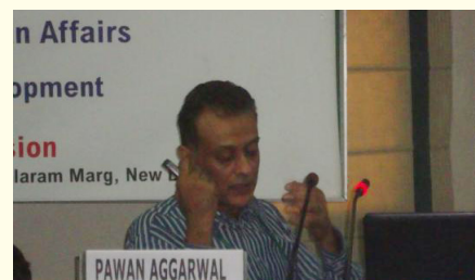
Figure 4, Resource Persons presenting their presentations during Batch 10 Workshop, September 19