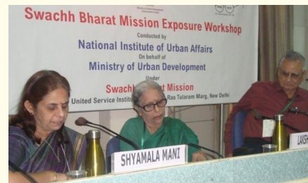
Figure 2, Resource persons giving presentations during batch 9 workshop, September 5