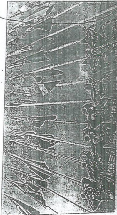
Soldiers blew bridges during the inauguration of a war memorial in Drass on Tuesday.