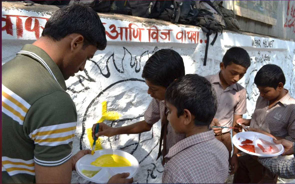
Wall paintings and murals on theme of 'cleanliness' by students on compound walls