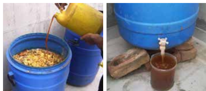
Extended EM solution added for the decomposition of cooked food and to prepare the extract. Extract obtained from cooked food