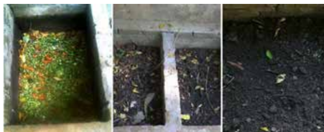
Raw vegetables and dry leaves added to the pit A Final compost in Pit C Composting in Pit B and C

Note : During compost preparation, final Effective Micro-organism (EM) solution is added in pit B and C to expedite the process.